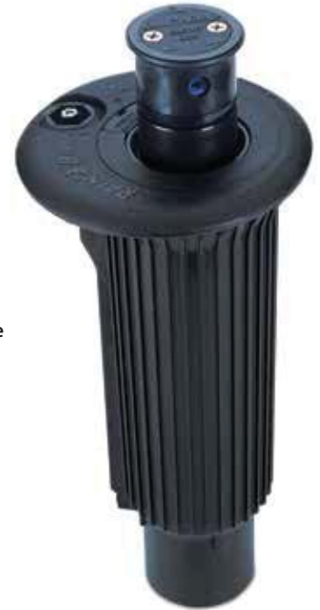
● EAGLE™ 900 Series